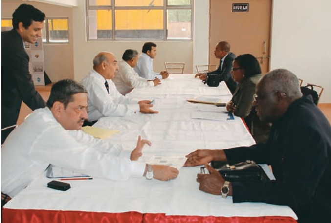
B2B meet is in progress.

businesses and has one of the highest growth rates and per capita incomes in Latin America.